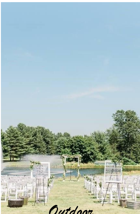
Outdoor Fountain View

*Barn options only valid for Barn weddings