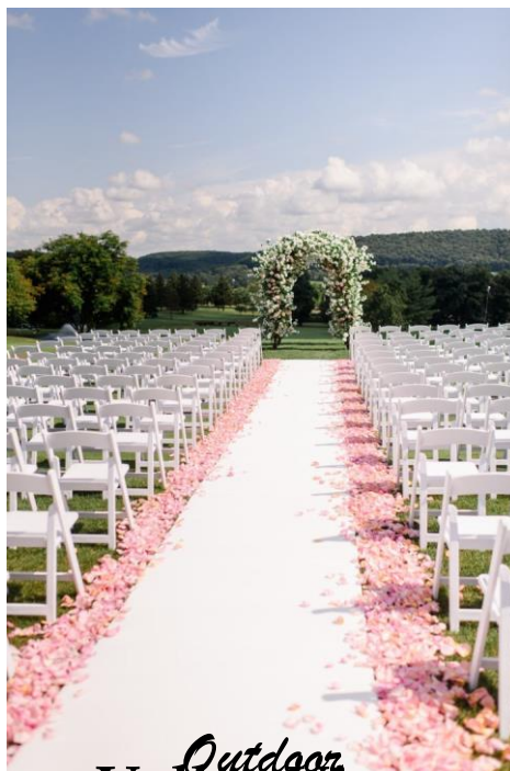
Outdoor Valley View