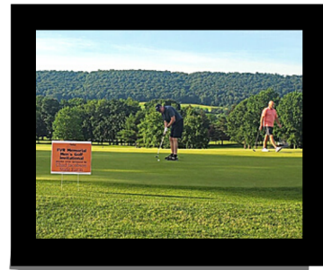
Practice Areas (3 areas) $500