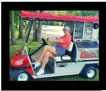
Beverage Carts (2 carts) $500