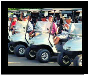
Players' Carts (44 carts) $500