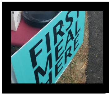
Player Meals (3 days) $500