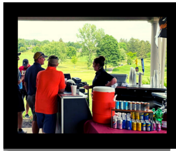
Patio Bar (3 days) $500